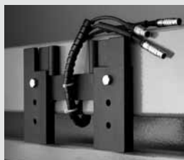
Item No. 1 690 701 020

4 multi-quick clamps, suitable for all rims from 13" to 24" diameter.