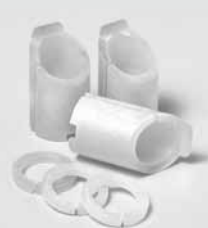
Plastic rim protectors for soft line rims.