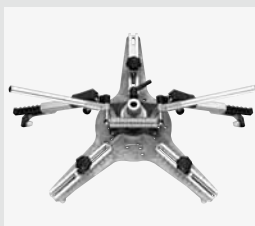
Item No. 1 690 501 250

4 multi-quick clamps, suitable for all rims from 13" to 24" diameter.