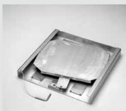
2 short sliding plates.