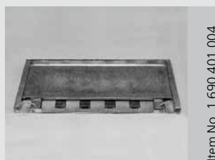
Alternatively 2 long sliding plates.