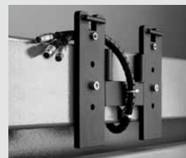
Item No. 1 690 701 018

Easy 3D above-ground hoist attachment: Pivot type.