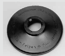
Spacer ring for wide rims with large dish depth (for 825 DT)